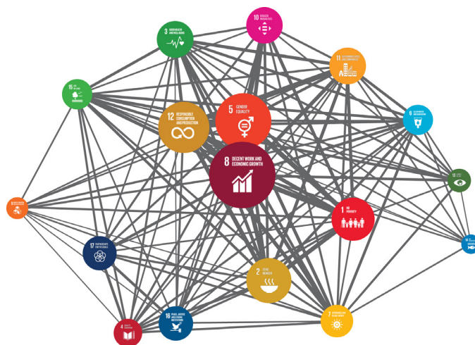
Figure 1. The SDGs addressed by the 43 conference papers

During the conference, all papers provided evidence that SSEOs contribute to achieving multiple goals and targets. In particular, the papers presented at the three sessions on Women's Empowerment and Gender Equality , Food and Agriculture , and Eco-social Approach explained diverse pathways, enabling factors and obstacles faced by SSE in achieving the SDGs.