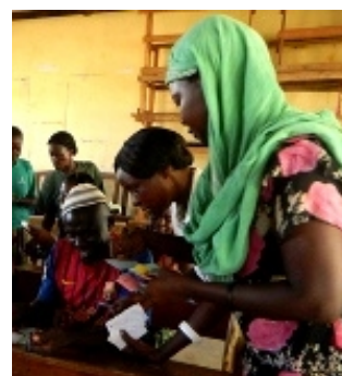
Illustration 1: Kenyan small-business owners at a complementary currency workshop.

The organization Koru-Kenya 6 is working to use complementary currencies as sustainable development modules in impoverished communities across Kenya with programs in informal settlements. In a recent survey organized by Koru-Kenya, preliminary findings indicate that over 75% of sales in an informal settlement known as Bangladesh in Kenya, are due to women owned and operated small businesses. While women make up the bulk of the businesses and labour, men owned businesses are earning nearly twice the profits. Compounding this gender inequality, women experience a 'double burden' or 'second shift' by performing a disproportionate amount of household work, such as taking care of children and elderly. Faith Atieno,