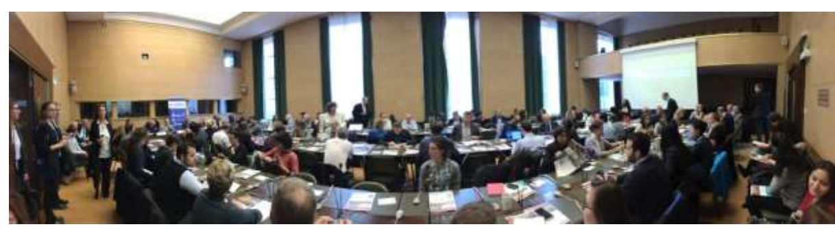
Launch of UNRISD's 2016 Flagship Report. Geneva, October 2016

• The report was unveiled to the UNOG Press Corps on 11 October at a press briefing and the upcoming launch brought to their attention.