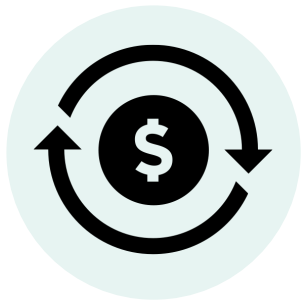
Figure 8.1. Guidelines for action toward transformative change

Six broad guidelines for action can be distilled from the policy implications shown in table 8.1. This report recommends them (figure 8.1) to national and international policy makers if transformative change is to occur.